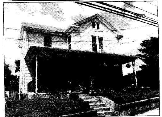
left: Church of God's original parsonage at 122 N. 21 st and above, the house as it was this past summer of 2009.

Across the street from the Church of God, on Church Street, (North 21 st Street, since 1922), stands the Parsonage of the Church of God. Please get out your magnifying glass to better admire the decorative trim around the windows. The trim was "lost" during a window replacement or siding updating.