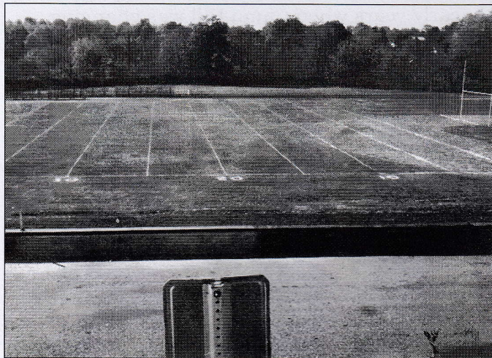
from the Mary Enterline Fenical 1963 collection