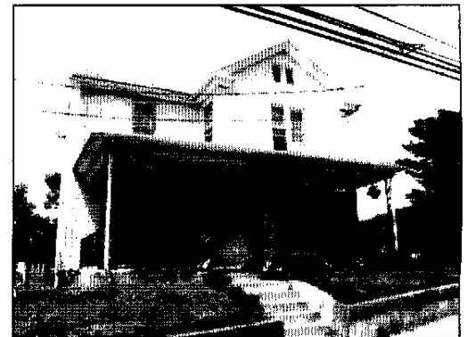
left: Church of God's original parsonage at 122 N. 21 st and above, the house as it was this past summer of 2009.

Across the street from the Church of God, on Church Street, (North 21 st Street, since 1922), stands the Parsonage of the Church of God. Please get out your magnifying glass to better admire the decorative trim around the windows. The trim was "lost" during a window replacement or siding updating.